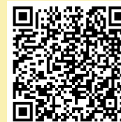
TUITION FEES FOR UNDERGRADUATE