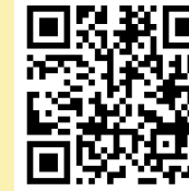
GUIDELINES & REQUIREMENT FOR UNDERGRADUATE