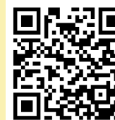
APPLICATION ADMISSION FOR UNDERGRADUATE